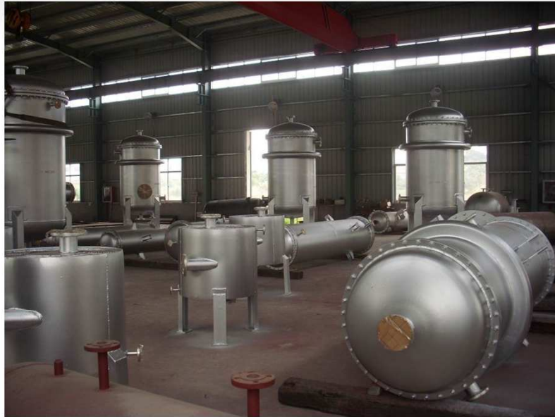
Pressure Vessels (Painting)