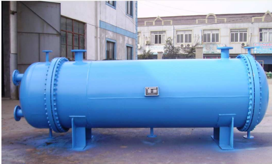
Shell and Tube Heat Exchangers