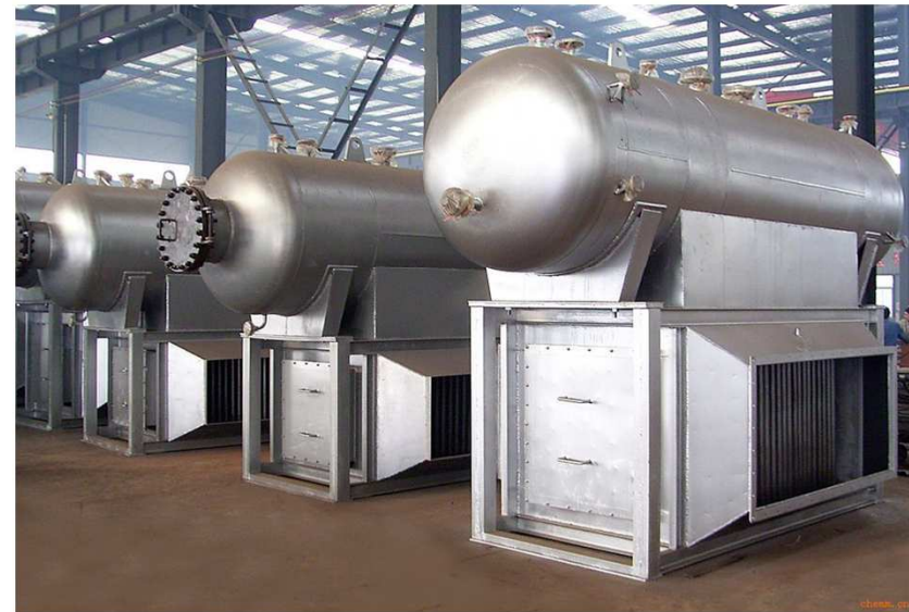
Waste Heat Boiler