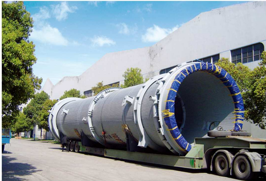
Converter Hood for Baosteel